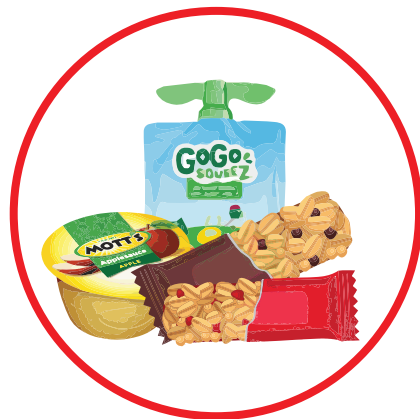
Nut Free Kids Snacks